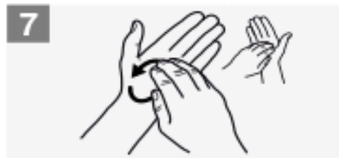
Rotational rubbing, backwards and forwards with clasped fingers of right hand in left palm and vice versa;