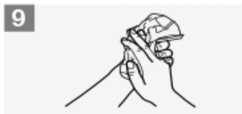
Dry hands thoroughly with a single use towel;