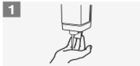
Apply enough soap to cover all hand surfaces;