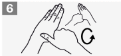
Rotational rubbing of left thumb clasped in right palm and vice versa;