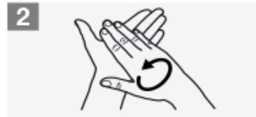
Rub hands palm to palm;