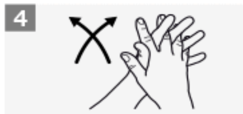
Palm to palm with fingers interlaced;