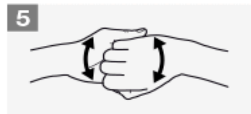
Backs of fingers to opposing palms with fingers interlocked;