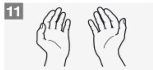
Your hands are now safe.