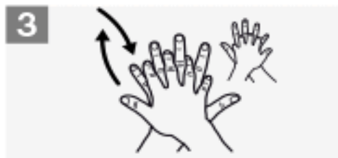
Right palm over left dorsum with interlaced fingers and vice versa;